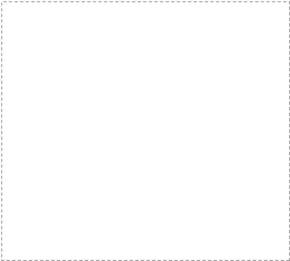
Dashed Line For Imprint Area Only, Will Not Print.

3317 F.P.O. This is 50% smaller than actual imprint size